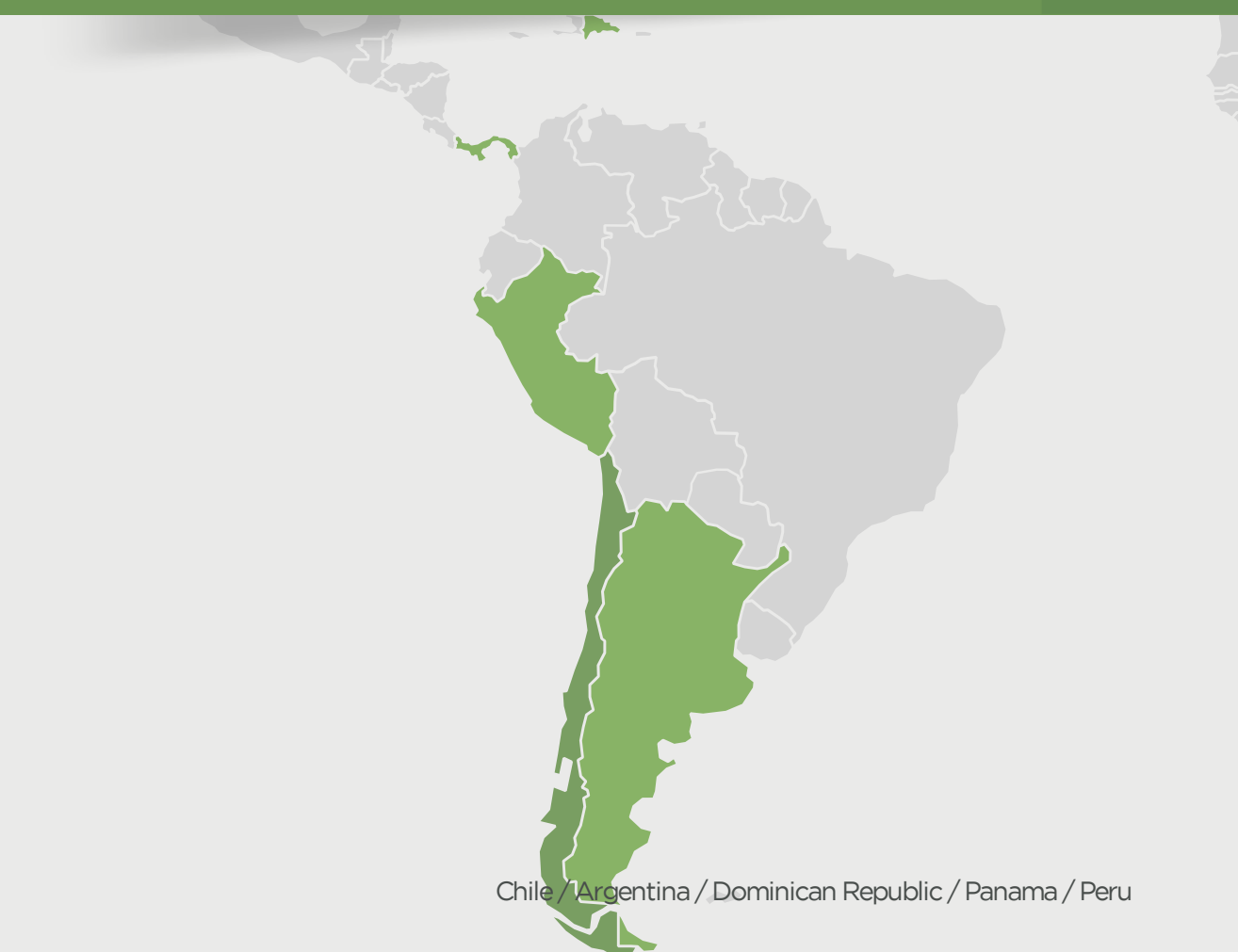
Chile / Argentina / Dominican Republic / Panama / Peru