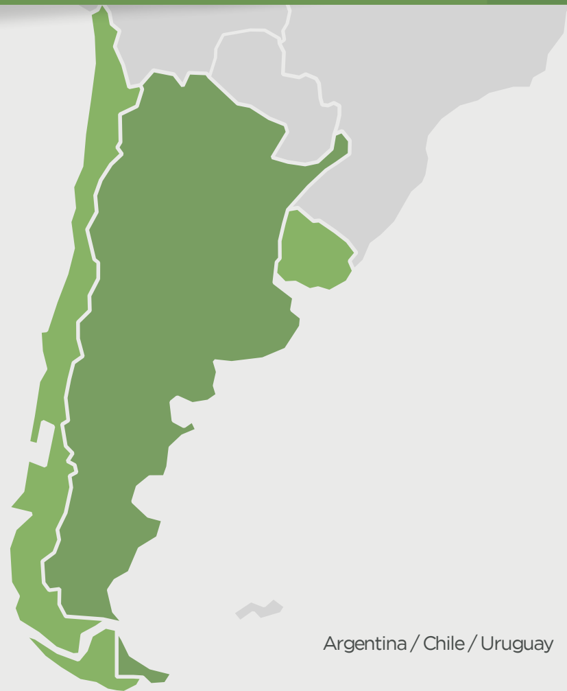
Argentina / Chile / Uruguay

Management of rhizospheric microorganisms