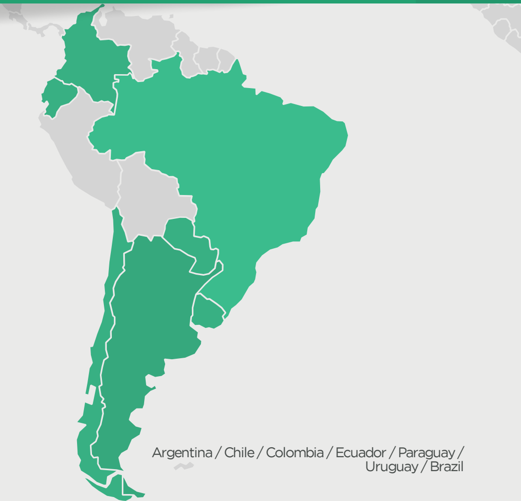
Argentina / Chile / Colombia / Ecuador / Paraguay / Uruguay / Brazil

techniques (EG, in this case) to geneticists and phyto- and zoo- Improvers with their role lead - Finally, it should be noted that the project seeks to solve problems of the region or each country.