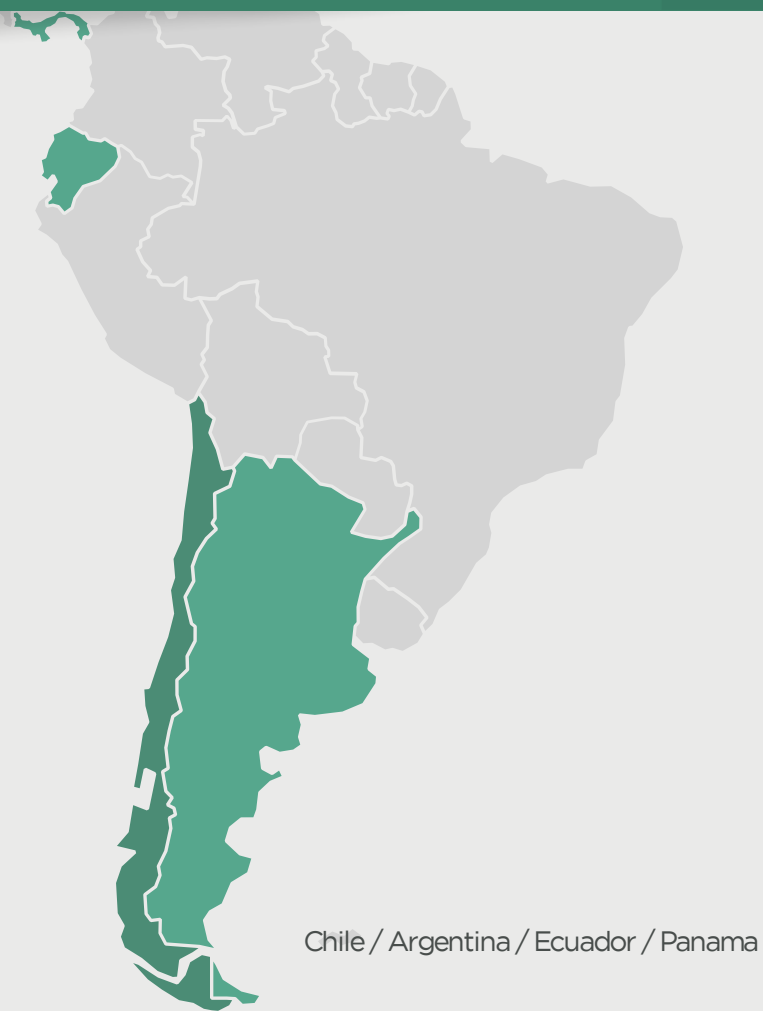
Chile / Argentina / Ecuador / Panama

beneficiaries were small farmers in the platform member countries. In Chile, work was carried out with 35 women farmers producing native potatoes on Chiloé Island; in Argentina, work was carried out with 6 farming families in Belgrano, Northern Argentina; in Ecuador, the direct beneficiaries were 120 farmers in the provinces of Cotopaxi, Pichincha and Chimborazo; while in Panama, work was carried out with 20 producers in the Cerro Punta sector, Chiriquí.